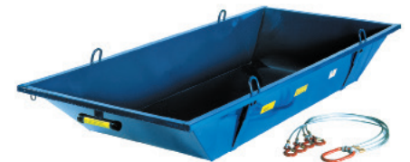
1200 lb. Trash Tray