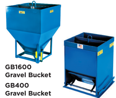
GB1600 Gravel Bucket GB400 Gravel Bucket