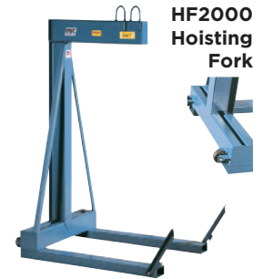
HF2000 Hoisting Fork